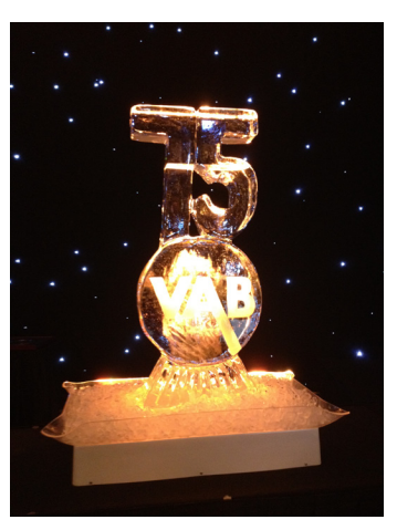
An ice sculpture commemorating the 75th Anniversary of the Summer Convention was donated by the Hilton Virginia Beach Oceanfront.