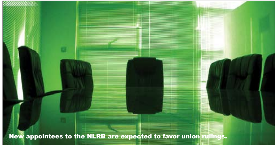
New appointees to the NLRB are expected to favor union rulings.

Becker's past writings are of particular concern to employers. He has opined that employers should not be parties to NLRB election procedures at all. He has suggested that only employees and unions should be parties to pre-election hearings. Becker has stated that employers can have some campaign rights, but such rights should be substantially lim-